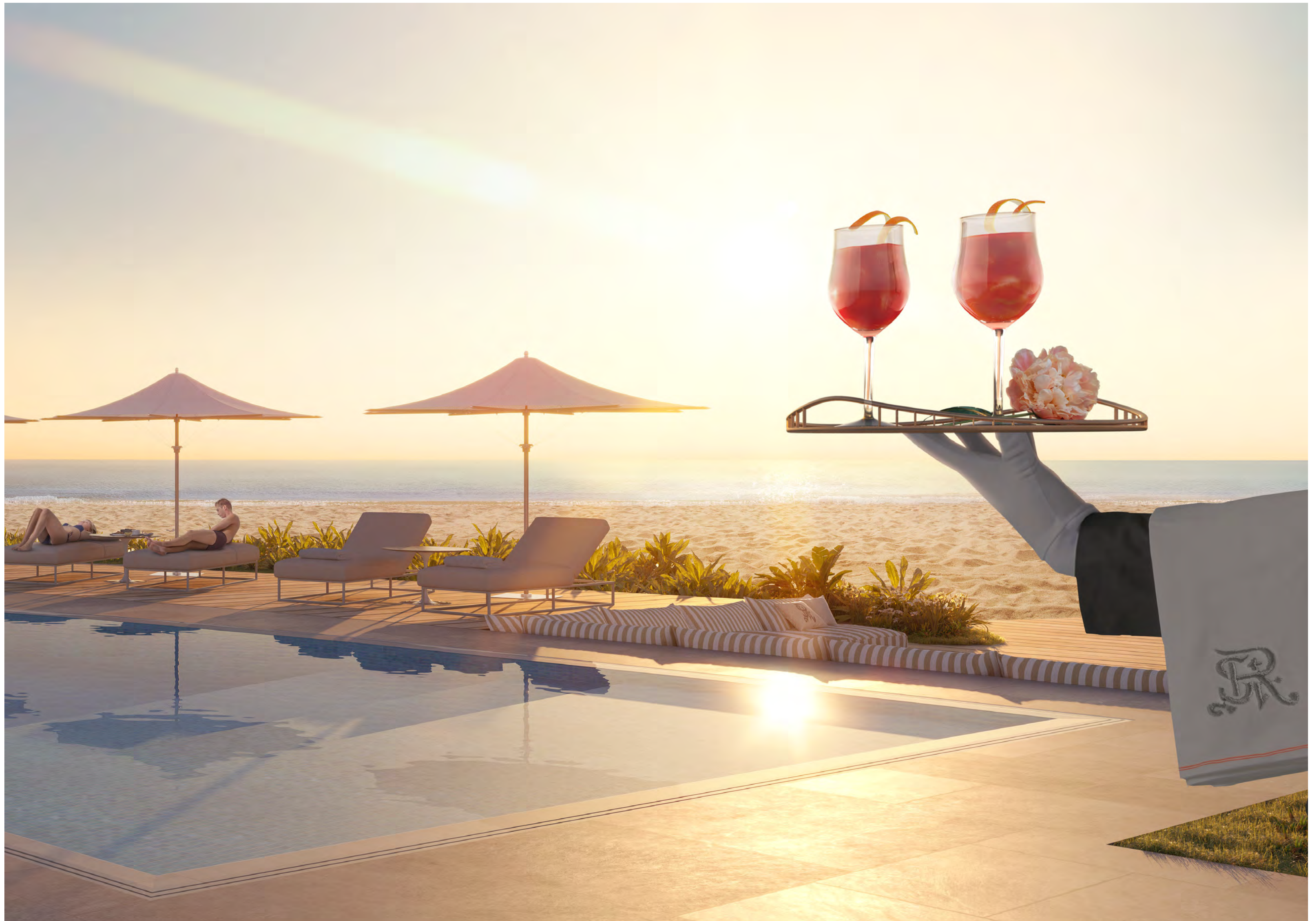
THE ST. REGIS RESIDENCES, SUNNY ISLES BEACH, MIAMI