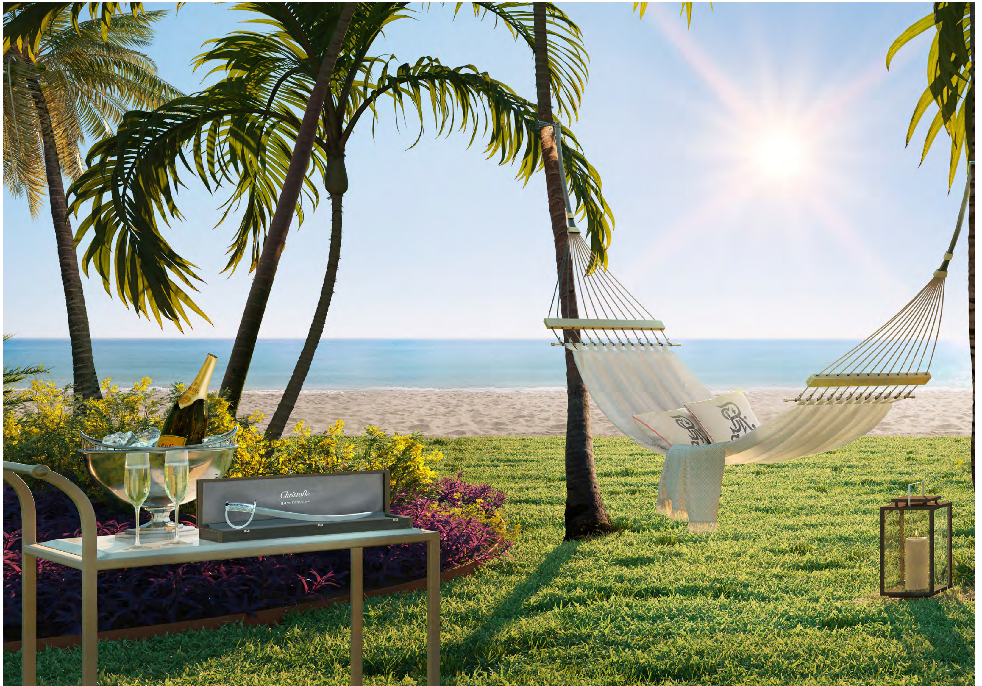
THE ST. REGIS RESIDENCES, SUNNY ISLES BEACH, MIAMI